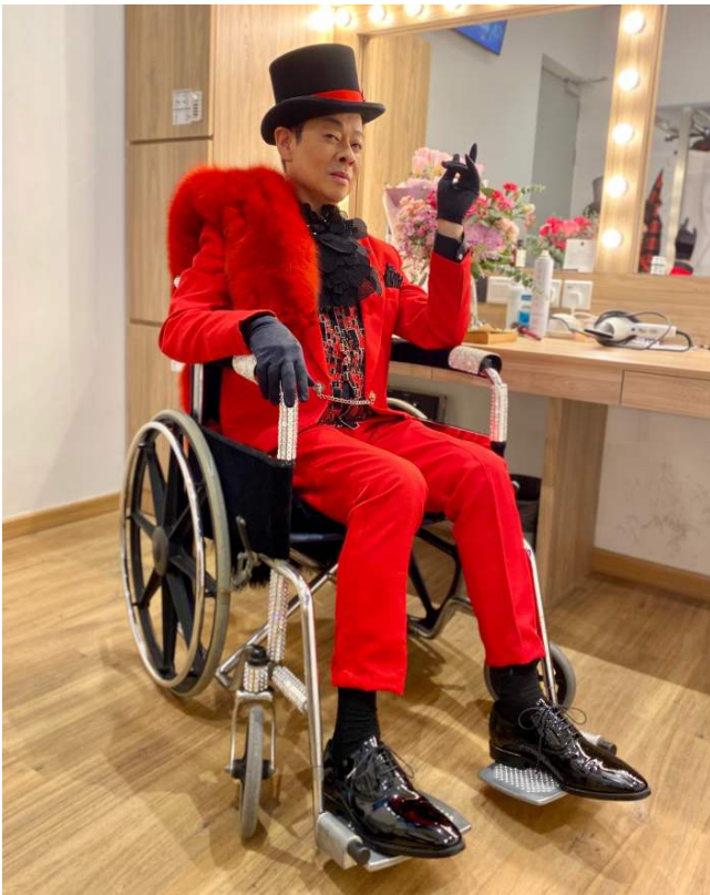
Bling It On! Lady Bracknell is ready to make her entrance!

"We only had brief pockets of time between performances to work with. So, with every successive performance, you get a little bit more bling."