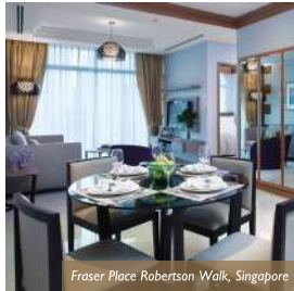
Fraser Place Robertson Walk, Singapore