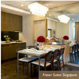
Fraser Suites Singapore