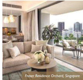
Fraser Residence Orchard, Singapore

More than a hotel, our Gold Standard serviced residences feel just like home. Only better.